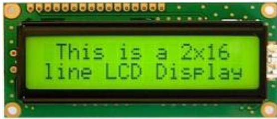
Fig. : LCD Display

The LCD display consists of two lines, 20 characters per line that is interfaced with the PIC16F73. The protocol (handshaking) for the display is as shown in Fig. The display contains two internal byte-wide registers, one for commands (RS=0) and the second for characters to be displayed (RS=1). It also contains a user-programmed RAM area (the character RAM) that can be programmed to generate any desired character that can be formed using a dot matrix. To distinguish between these two data areas, the hex command byte 80 will be used to signify that the display RAM address 00h will be chosen Port1 is used to furnish the command or data type, and ports 3.2 to 3.4 furnish register select and read/write levels.